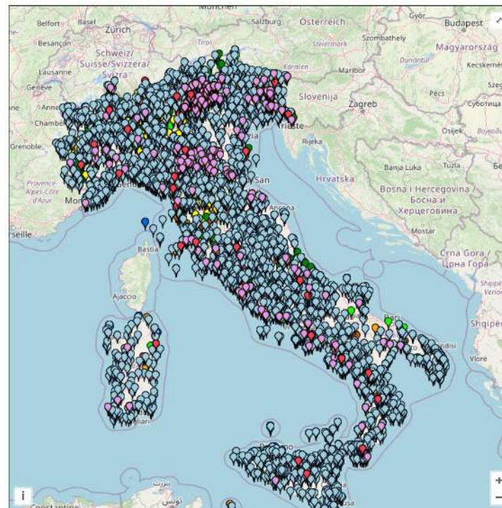
Fig.4 Allegato presentazione C.Baccani 25 Ottobre 2023