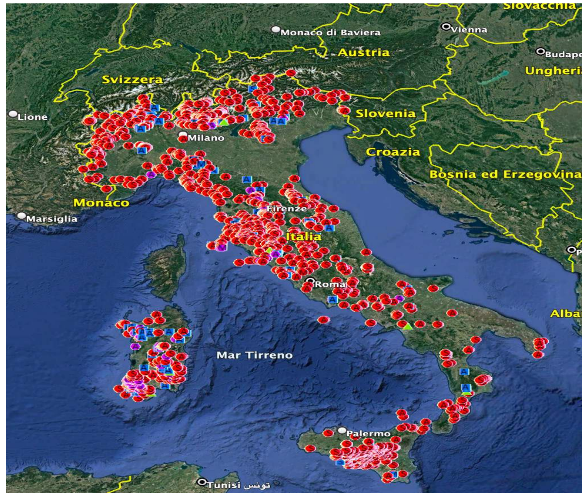
Fig.2 Allegato presentazione C.Baccani 25 Ottobre 2023

Sono stati censiti 3.006 siti in particolare: Sicilia (761 siti), Sardegna (438), Toscana (413) e Piemonte (378).